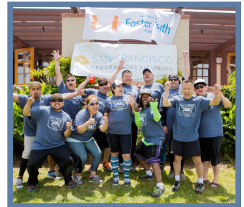
Human Services Agency team mugging for the camera.

THE SAN FRANCISCO FOSTER YOUTH FUND would like to thank the 500+ players who participated in the Mae Louise Mays Charity Softball Tournament on June 20th. Congratulations to the winning team, the Sheriff's Department. It was a lovely day with friends and colleagues having fun together for a good cause. Every penny the Fund raised from the tournament will go directly to foster children, making it possible for them to participate in enrichment activities, to attend school graduations, and to get support for college costs.